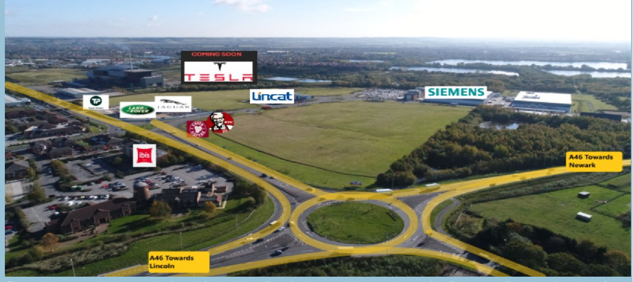
nese particulars are provided as a general outline only, for the guidance of intending lessees, and do not constitute part of an offer or contract. Descriptions, dimensions, refer nces to condition and necessary permissions for use and occupation and other details are given in good faith and believed to be correct, but interested parties must satisfy emselves as to their accuracy. Unless otherwise stated all prices quoted are exclusive of VAT.